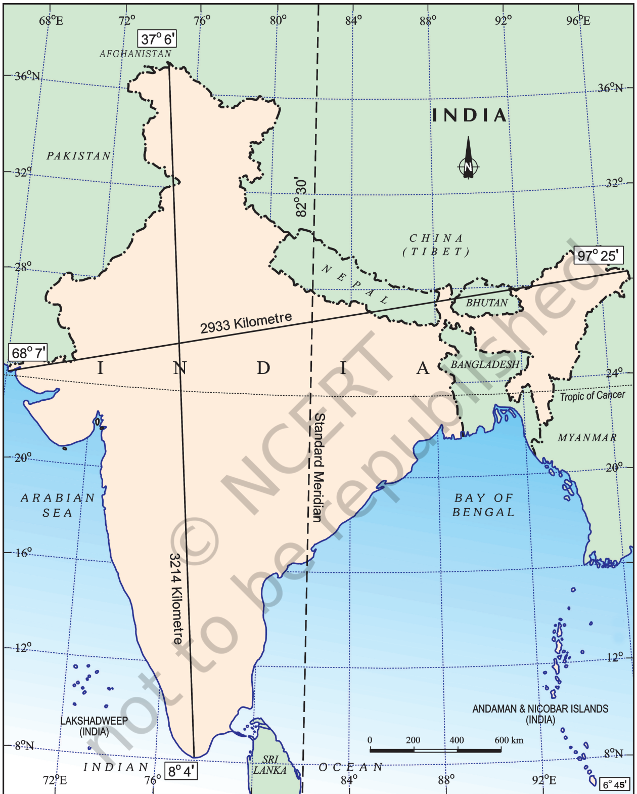
Figure 1.3 : India : Extent and Standard Meridian