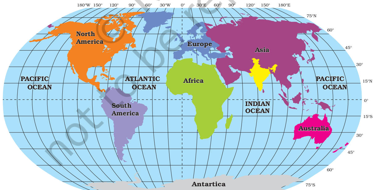
Figure 1.1 : India in the World

The land mass of India has an area of 3.28 million square km. India's total area accounts for about 2.4 per cent of the total geographical