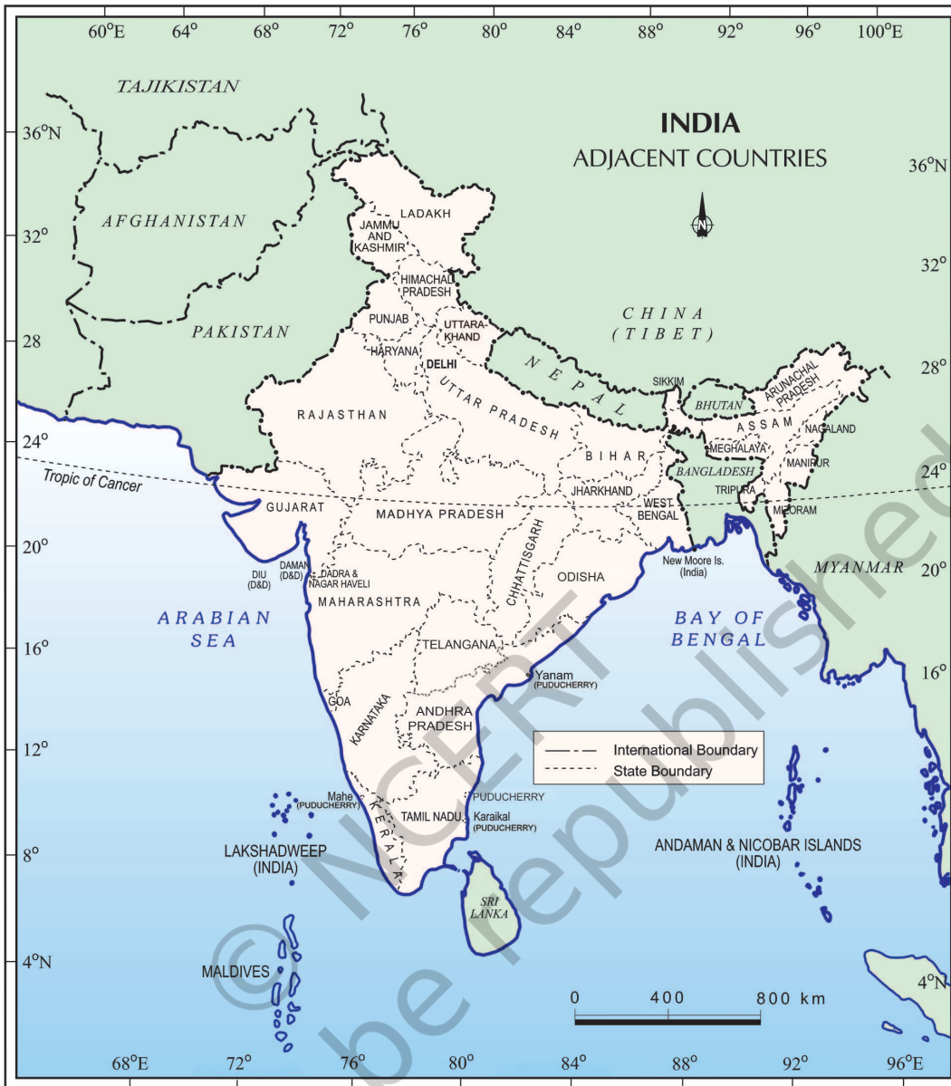
Figure 1.5 : India and Adjacent Countries

Sri Lanka and Maldives. Sri Lanka is separated from India by a narrow channel of sea formed by the Palk Strait and the Gulf of Mannar, while Maldives Islands are situated to the south of the Lakshadweep Islands.